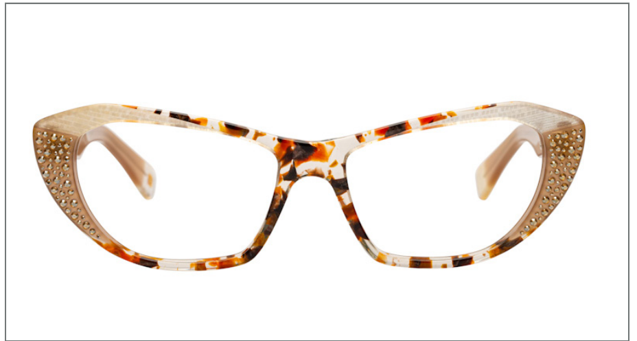
ORIGINAL SWAROVSKI STONES