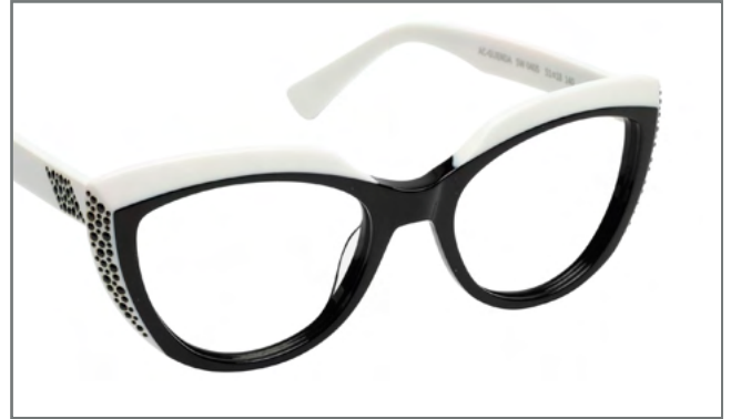
ORIGINAL SWAROVSKI STONES