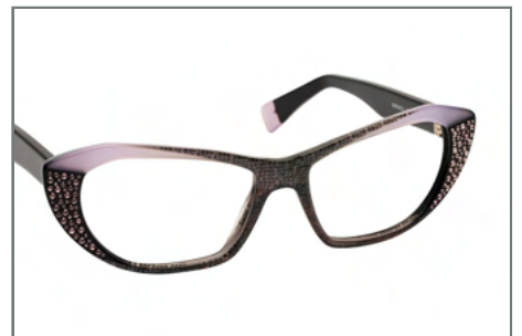
ORIGINAL SWAROVSKI STONES c. SW 0426