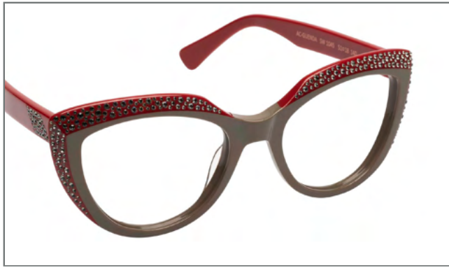
ORIGINAL SWAROVSKI STONES