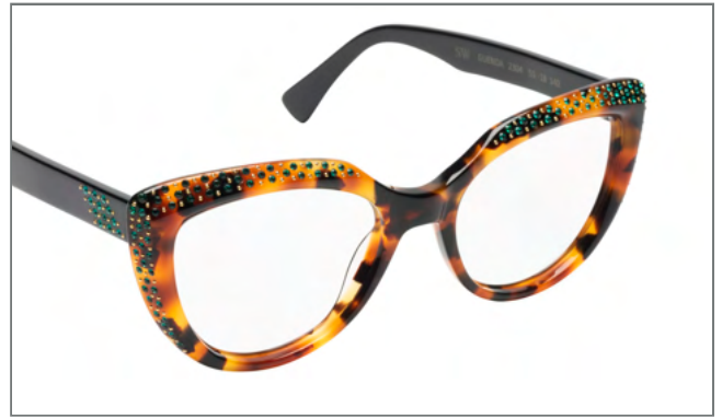
ORIGINAL SWAROVSKI STONES