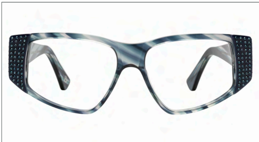
ORIGINAL SWAROVSKI STONES