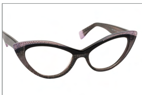
ORIGINAL SWAROVSKI STONES c. SW 0426