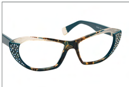
ORIGINAL SWAROVSKI STONES c. SW 1937