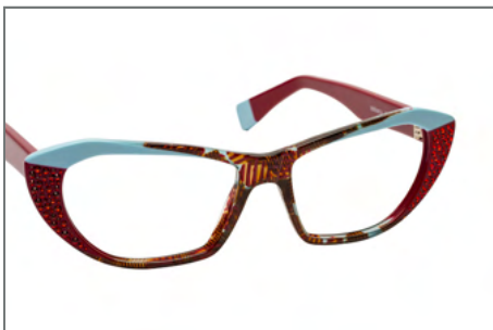
ORIGINAL SWAROVSKI STONES c. SW 3307