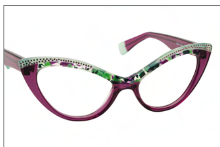
ORIGINAL SWAROVSKI STONES c. SW 1228