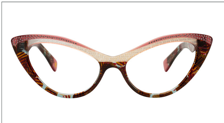
ORIGINAL SWAROVSKI STONES