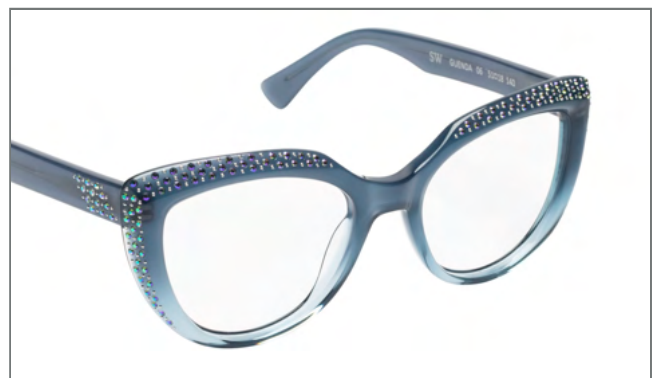
ORIGINAL SWAROVSKI STONES