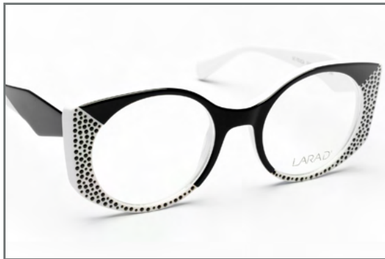
ORIGINAL SWAROVSKI STONES